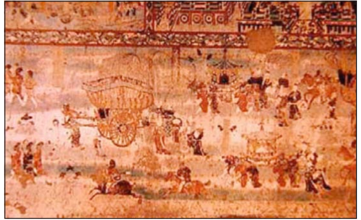
The mural An Outing by the Lady of Song of the Tang Dynasty (618- 907) depicts the grand scene of a Peeress's outing. Walking in front of the large procession is an acrobat doing pole balancing with four young boys doing stunts. These figures are vivid, lively and vigorous, and is considered the most complete extant Chinese mural containing images of acrobatics.

During the Han Dynasty (221BC-220AD) these rudimentary acts of acrobatics developed into the “Hundred Plays.” Many more acts were soon to develop. Music accompaniment and other theatrical elements were added as interest in the art form grew among the emperors. According to the stone engravings unearthed at Yinan County of Shandong Province in 1954, there were superb acrobatic performances with music accompaniment on the acrobatic stage of